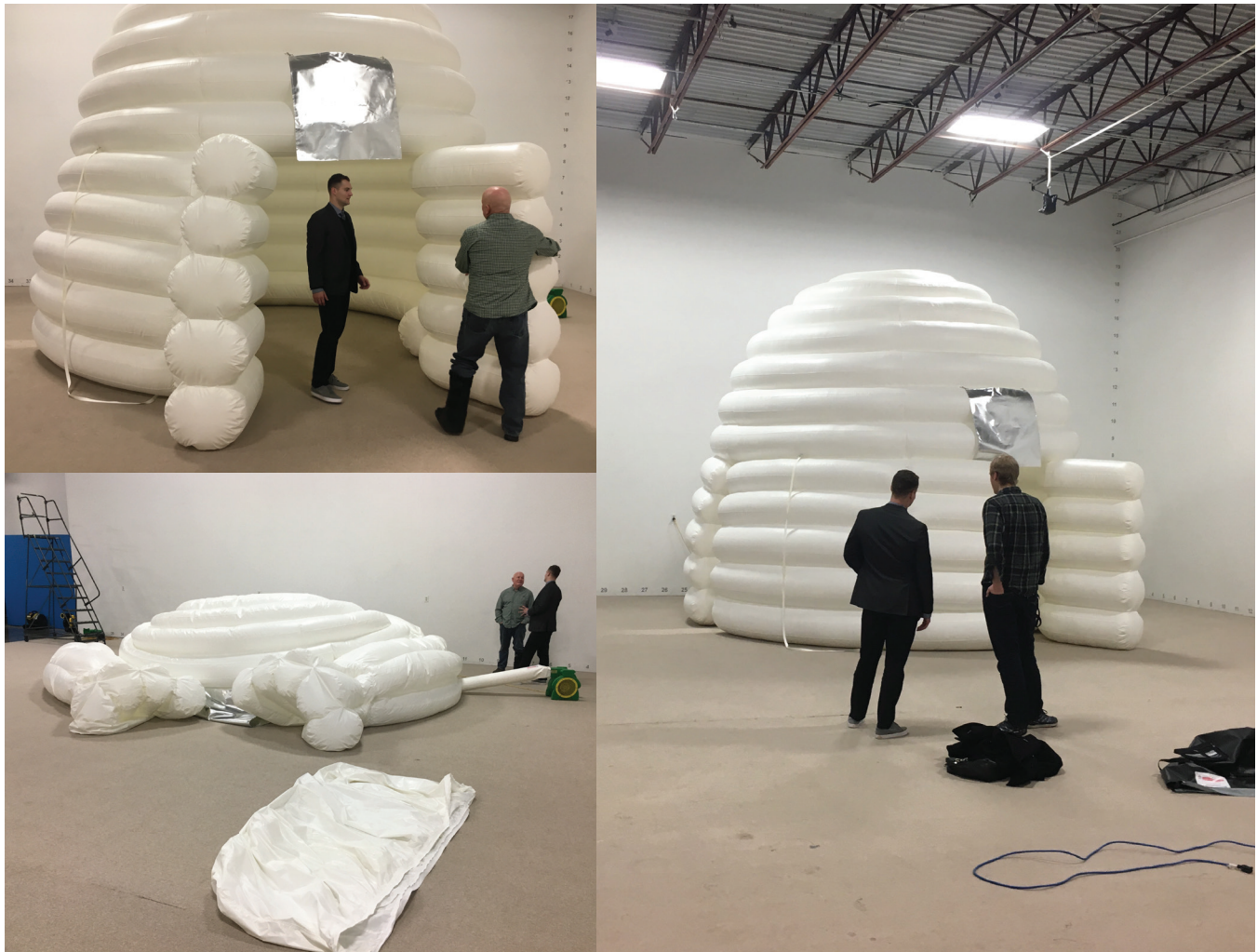
Figure 3: Test inflation of The Warming Hive at Landmark Creations near Minneapolis, Minnesota on January 5, 2017. The pneumatic inflates in under three minutes, and is powered by two portable blowers (one inflates the enclosure, and the other inflates the interior bench). Weighing under 200 pounds, The Warming Hive packs up into a bag and can easily be transported by car to a selected site and installed by two people.

new technologies, Price was continually searching for ways to redesign the built environment as an adaptive and interactive infrastructure that could anticipate the changing needs of society. He was less interested in buildings—Price deemed them fixed, static, inflexible and obsolete—and more intent on structures that could anticipate future change and use. 2 This is why, starting in the early 1960s, he worked to bring attention to the potential of “air,” which until then had been mostly invisible to architecture. The near instantaneity and perceived instability of air structures led Price to dedicate years of his practice to their development and regulation. 3 A champion of “anticipatory design,” 4 Price referred to air structures as “valuable distorters of time, place and frequency for social advantage.” 5