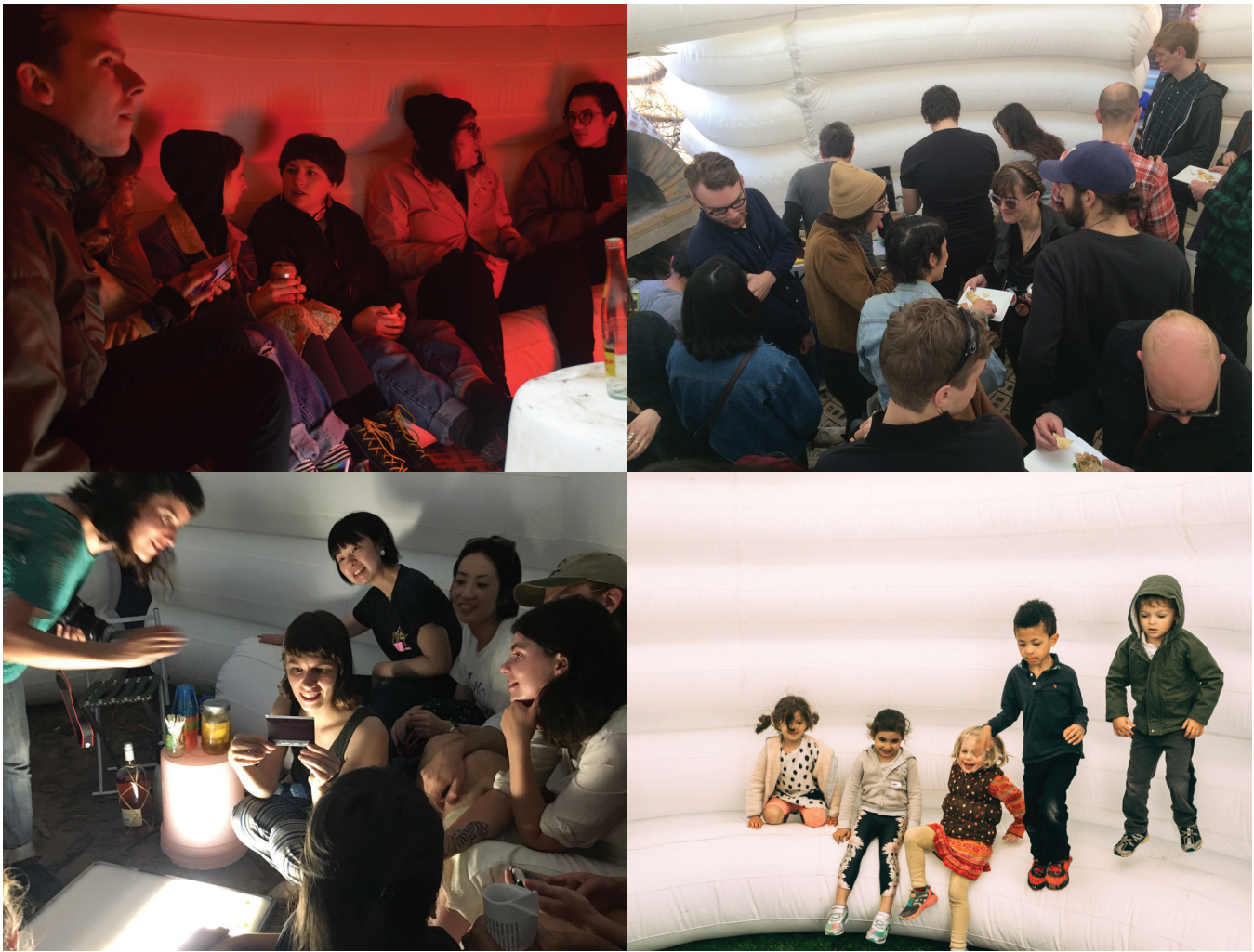
Figure 5: Four different inflations of The Warming Hive in 2017 demonstrating social resilience through community engagement. Capable of being deployed in both urban and rural settings, the pneumatic enclosure provides a gathering and recreation space for all ages, any time of day or night.

Because this winning proposal—selected by the artists/clients and visiting critics—directly engaged with a heat source, it needed to comply with life safety concerns and code regulations. That is, the pneumatic structure needed to be both fireproof and durable. Due to these constraints, it was not an option to work with typical DIY inflatable materials like plastic sheeting, Mylar and nylon. Fabricated by Landmark Creations in Minnesota using flame retardant 8.5 oz. vinyl coated white nylon, this structure inflates in under three minutes, and is able to have a lifespan of 10+ years, rather than days, changing the typical perception of pneumatics structures as disposable, wasteful, and unreliable.